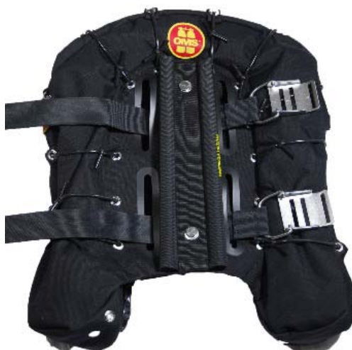
Single Tank Adapter Installed