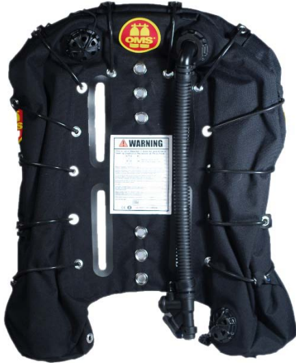
Deflated OMS Wing with Retraction Bands

Once all the knots are tied, pull each of them around so that it is safely tucked near the backside of each inner grommet (tank side/no-label side). Deflate the wing and check that it deflates evenly around the entire circumference. Orally inflate the wing to be sure the bands are not too snug. You should be able to orally inflate the BC with little effort. If there is excessive resistance to oral inflation loosen the bands.