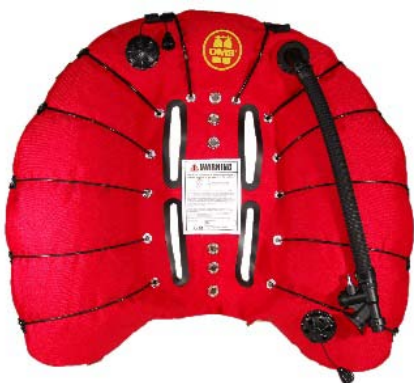
Deep Ocean Wing

OMS air cells can be attached to any OMS backplate system using the bolts from a set of steel bands for doubles or the bolts from a single tank adapter. Nylon tank bands can be used to attach it to the IQ Pack.