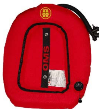
Performance Double Wing