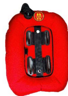
Performance Mono Wing