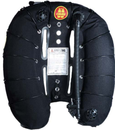
Inflated OMS Wing with Retraction Bands