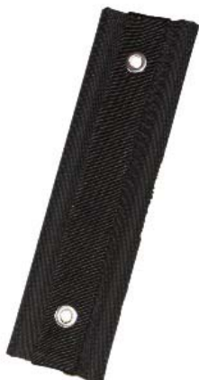
Single Tank Adapter Uninstalled

The soft single tank adapter and stainless steel single tank adapter will work with all of the OMS Wings except for the Performance Mono and Performance Double Wing to achieve the best possible performance.